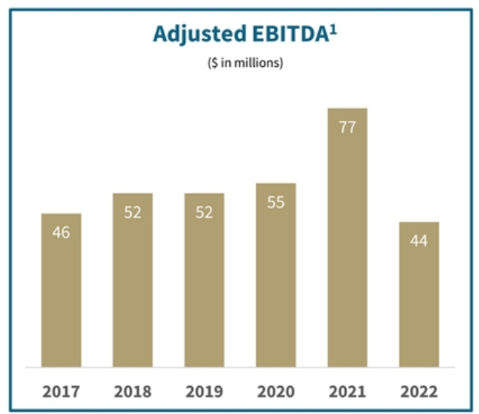
^{\rm 1}\,\mbox{Adjusted} to reflect the add-back of stock compensation expense.